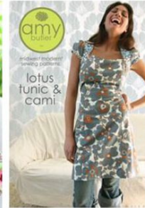
lotus tunic & cami